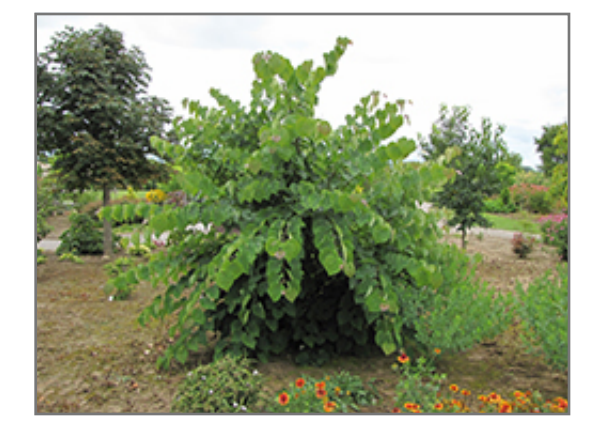
Little Woody Redbud

A spectacular and hardy spring bloomer, with a compact growth habit; very showy fuchsia flowers held tightly on bare branches in early spring; lovely crinkled green foliage; a great small ornamental tree for specimen use in the northern landscape