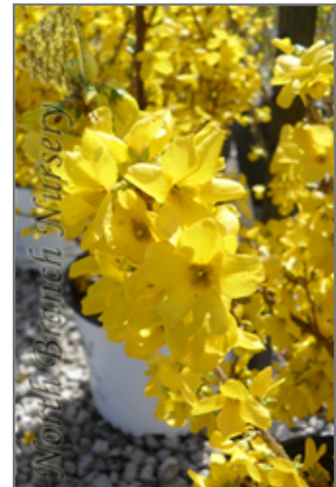
Show Off Forsythia