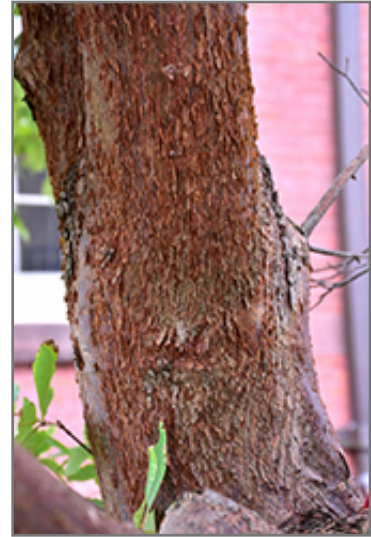
Gingerbread Paperbark Maple bark

Available in multi-stem (clump form, several trunks) or with a single, low branched trunk