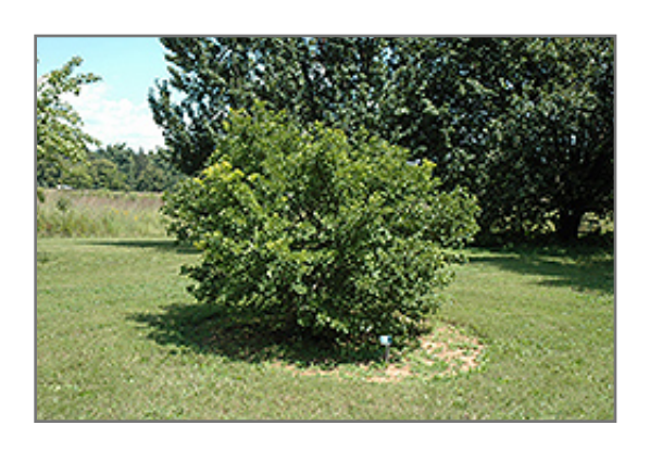
Jade Butterflies Ginkgo

Jade Butterflies Ginkgo is recommended for the following landscape applications;