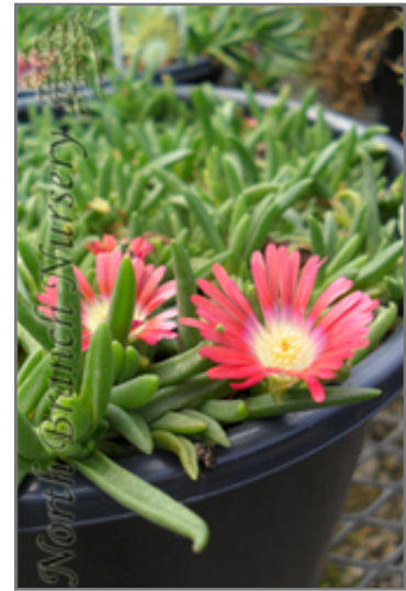
Ice Plant