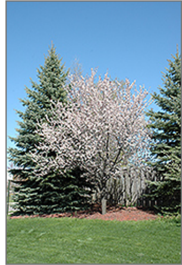
Newport Plum in bloom

This tree should only be grown in full sunlight. It does best in average to evenly moist conditions, but will not tolerate standing water. It is not particular as to soil type or pH. It is highly tolerant of urban pollution and will even thrive in inner city environments. This is a selected variety of a species not originally from North America.