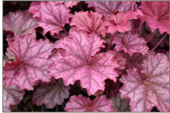
Berry Smoothie Coral Bells foliage

Berry Smoothie Coral Bells is recommended for the following landscape applications;