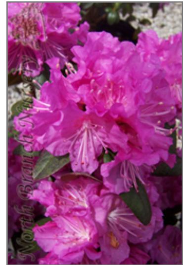
Blooms on PJM