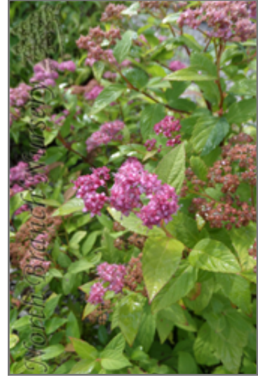
Goldflame Spirea

This shrub should only be grown in full sunlight. It prefers to grow in average to moist conditions, and shouldn't be allowed to dry out. It is not particular as to soil type or pH. It is highly tolerant of urban pollution and will even thrive in inner city environments. This particular variety is an interspecific hybrid.