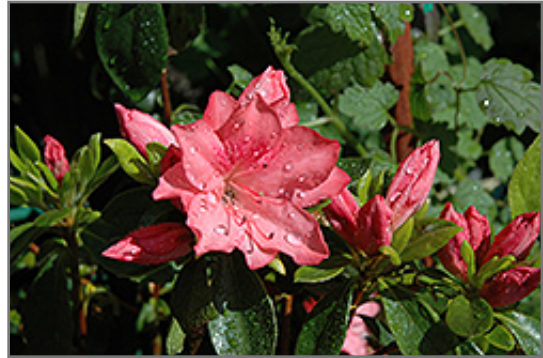
Renee Michelle Evergreen Azalea flowers