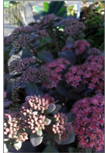
Dazzleberry Sedum

Dazzleberry Stonecrop is a dense herbaceous perennial with an upright spreading habit of growth. Its medium texture blends into the garden, but can always be balanced by a couple of finer or coarser plants for an effective composition.