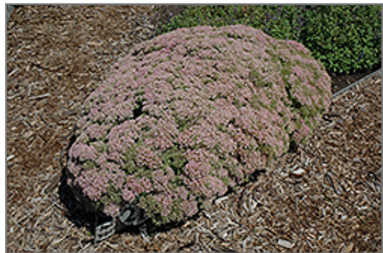
Rock 'N Grow Pure Joy Stonecrop in bloom