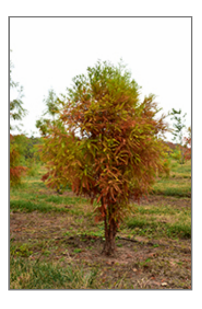
Debonair Baldcypress in fall