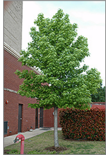
Happidaze Sweet Gum

This tree should only be grown in full sunlight. It prefers to grow in average to moist conditions, and shouldn't be allowed to dry out. It is very fussy about its soil conditions and must have rich, acidic soils to ensure success, and is subject to chlorosis (yellowing) of the foliage in alkaline soils. It is somewhat tolerant of urban pollution. This is a selection of a native North American species.