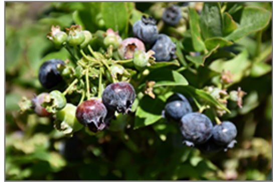
Jelly Bean Blueberry fruit