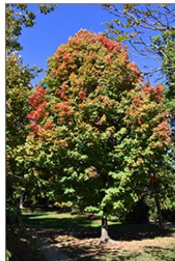
Endowment Sugar Maple