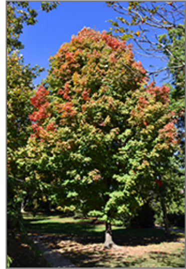
Endowment Sugar Maple