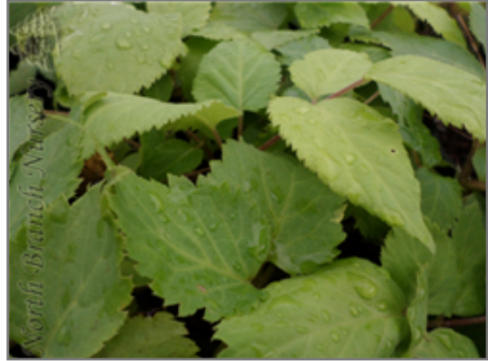
Sun King foliage

Sun King Japanese Spikenard will grow to be about 4 feet tall at maturity, with a spread of 4 feet. It tends to be leggy, with a typical clearance of 3 feet from the ground, and should be underplanted with lower-growing perennials. It grows at a medium rate, and under ideal conditions can be expected to live for approximately 10 years. As an herbaceous perennial, this plant will usually die back to the crown each winter, and will regrow from the base each spring. Be careful not to disturb the crown in late winter when it may not be readily seen!