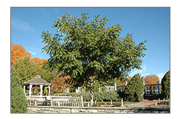
His Majesty Cork Tree