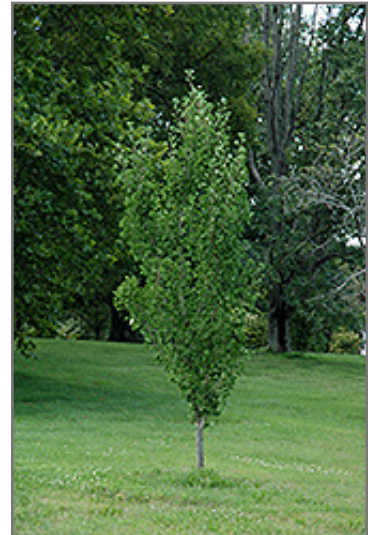
Presidential Gold Ginkgo