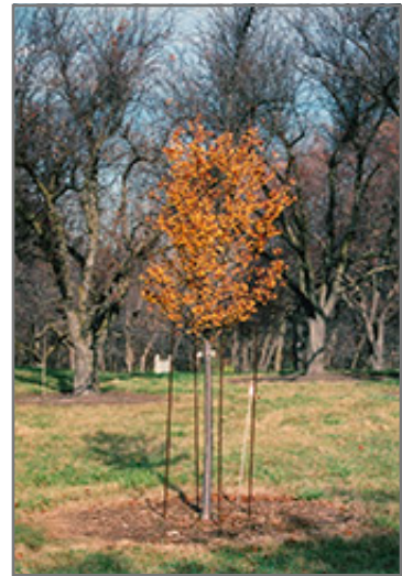
Lancelot Flowering Crab fruit