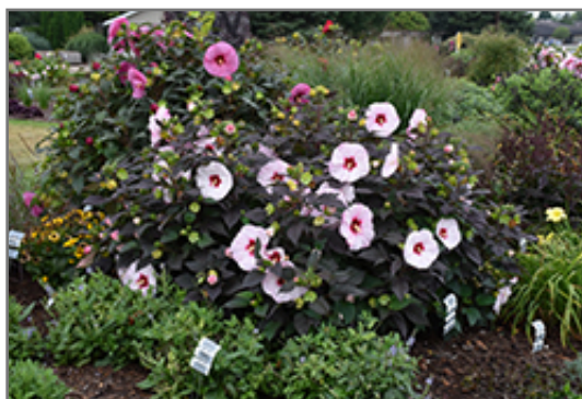
Perfect Storm Hibiscus in bloom