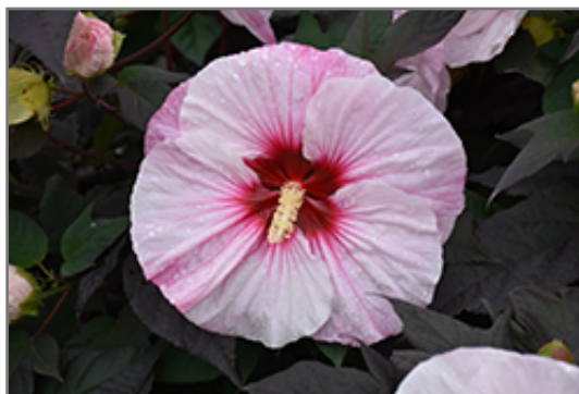
Perfect Storm Hibiscus flowers

Perfect Storm Hibiscus is recommended for the following landscape applications;