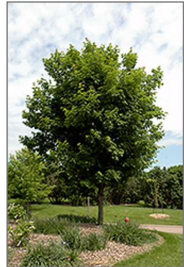
Sugar Maple

This tree should only be grown in full sunlight. It prefers to grow in average to moist conditions, and shouldn't be allowed to dry out. It is not particular as to soil pH, but grows best in rich soils. It is somewhat tolerant of urban pollution. This species is native to parts of North America.