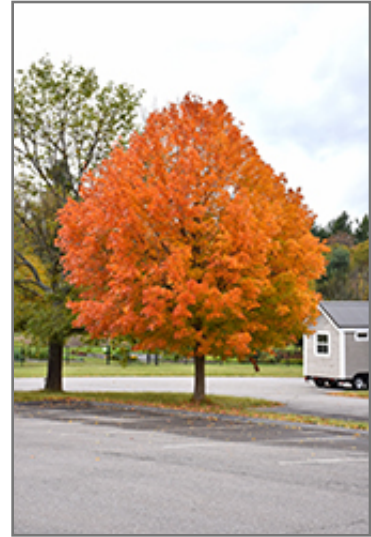
Sugar Maple in fall