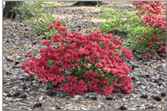
Girard's Crimson Azalea in bloom