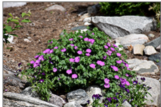
Sanguineum Cranesbill in bloom