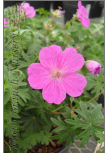
Hardy Geranium

Sanguineum Cranesbill is recommended for the following landscape applications;