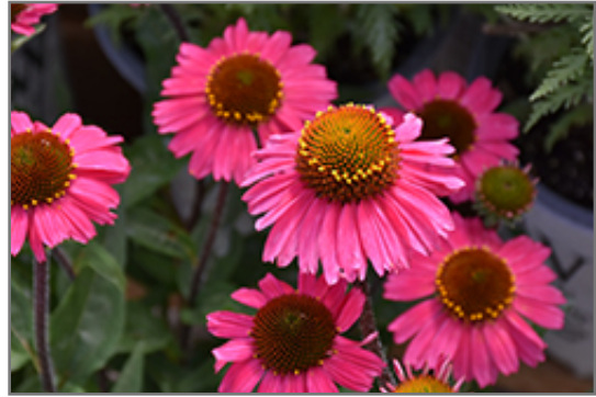
Sensation Pink Coneflower flowers

Sensation Pink Coneflower is recommended for the following landscape applications;