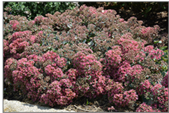
Popstar Stonecrop in bloom