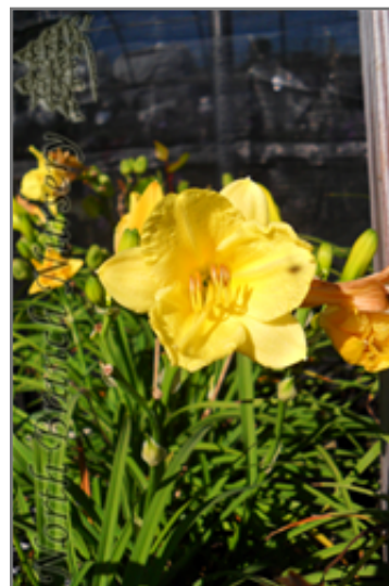
Happy Returns Daylily

This plant does best in full sun to partial shade. It is very adaptable to both dry and moist locations, and should do just fine under typical garden conditions. It is not particular as to soil type or pH. It is highly tolerant of urban pollution and will even thrive in inner city environments. This particular variety is an interspecific hybrid. It can be propagated by division; however, as a cultivated variety, be aware that it may be subject to certain restrictions or prohibitions on propagation.