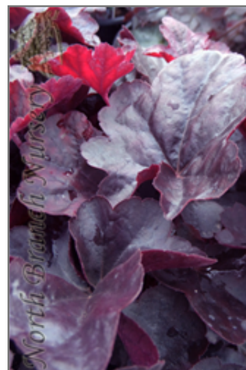
Obsidian Coral Bell