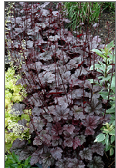
Plum Pudding Coral Bells in bloom