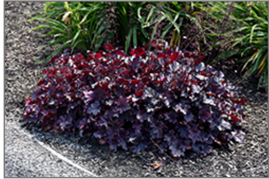
Plum Pudding Coral Bells

Plum Pudding Coral Bells is a fine choice for the garden, but it is also a good selection for planting in outdoor pots and containers. It is often used as a 'filler' in the 'spiller-thriller-filler' container combination, providing a mass of flowers and foliage against which the larger thriller plants stand out. Note that when growing plants in outdoor containers and baskets, they may require more frequent waterings than they would in the yard or garden.