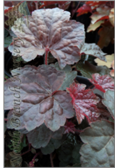
Palace Purple Coral Bell

Palace Purple Coral Bells is a fine choice for the garden, but it is also a good selection for planting in outdoor pots and containers. With its upright habit of growth, it is best suited for use as a 'thriller' in the 'spiller-thriller-filler' container combination; plant it near the center of the pot, surrounded by smaller plants and those that spill over the edges. Note that when growing plants in outdoor containers and baskets, they may require more frequent waterings than they would in the yard or garden.