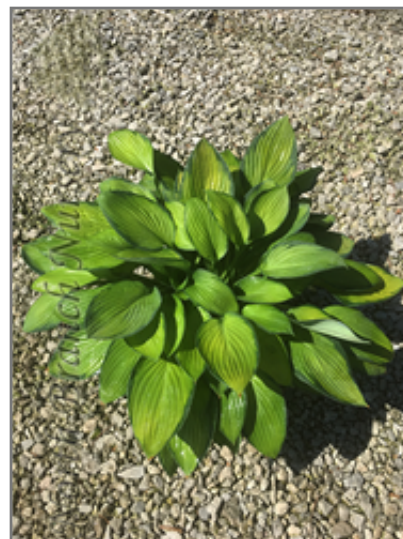
Gold Standard Hosta

This plant does best in partial shade to shade. It prefers to grow in average to moist conditions, and shouldn't be allowed to dry out. It is not particular as to soil type or pH. It is somewhat tolerant of urban pollution. This particular variety is an interspecific hybrid. It can be propagated by division; however, as a cultivated variety, be aware that it may be subject to certain restrictions or prohibitions on propagation.