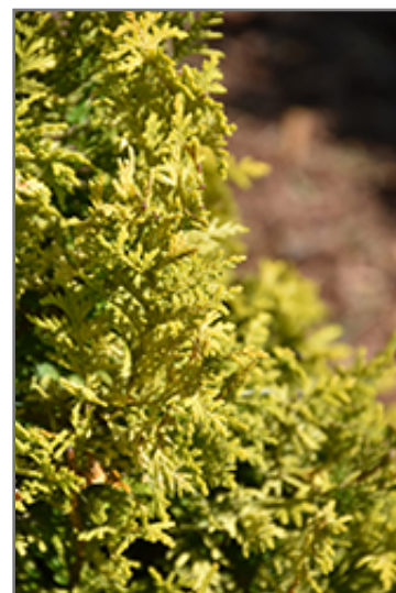
Soft Serve Gold Falsecypress foliage