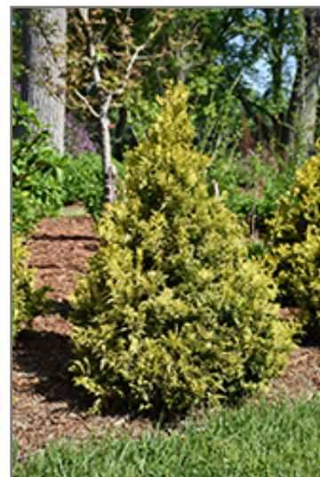
Soft Serve Gold Falsecypress

Soft Serve Gold Falsecypress is recommended for the following landscape applications;