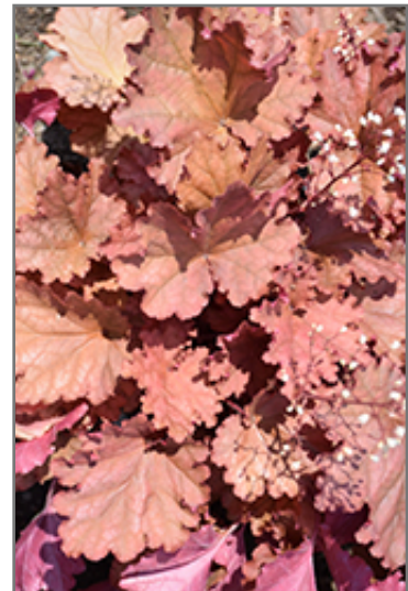
Peachberry Ice Coral Bells foliage