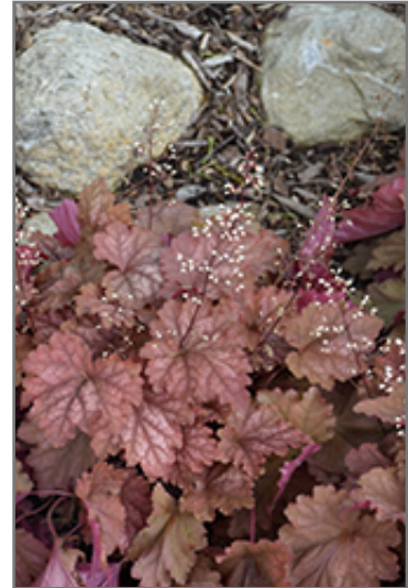
Peachberry Ice Coral Bells in bloom

Peachberry Ice Coral Bells is recommended for the following landscape applications;