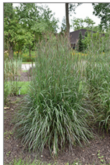
Black Hawks Big Bluestem in bloom