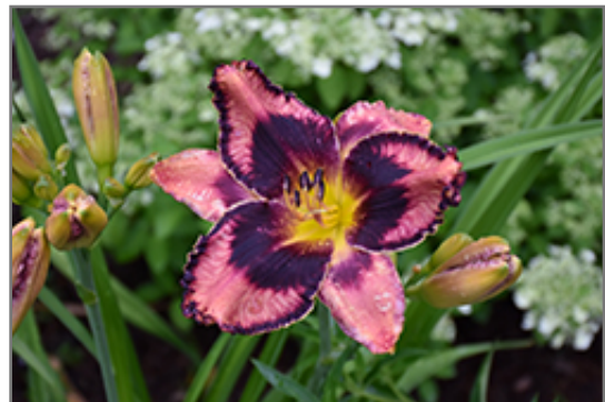
Rainbow Rhythm Storm Shelter Daylily flowers