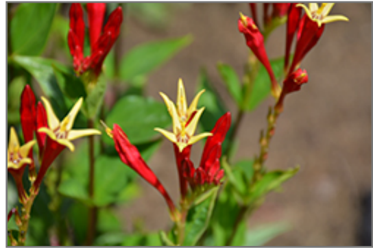
Little Redhead Indian Pink flowers