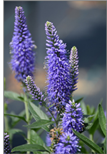
Skyward Blue Long-leaf Speedwell flowers

Skyward Blue Long-leaf Speedwell is a fine choice for the garden, but it is also a good selection for planting in outdoor pots and containers. It is often used as a 'filler' in the 'spiller-thriller-filler' container combination, providing a mass of flowers against which the larger thriller plants stand out. Note that when growing plants in outdoor containers and baskets, they may require more frequent waterings than they would in the yard or garden.