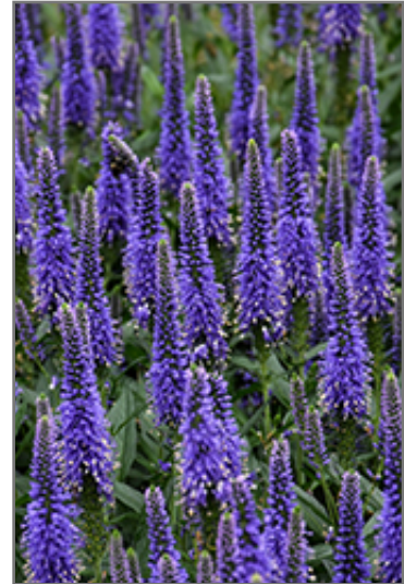
Skyward Blue Long-leaf Speedwell flowers

Skyward Blue Long-leaf Speedwell is recommended for the following landscape applications;