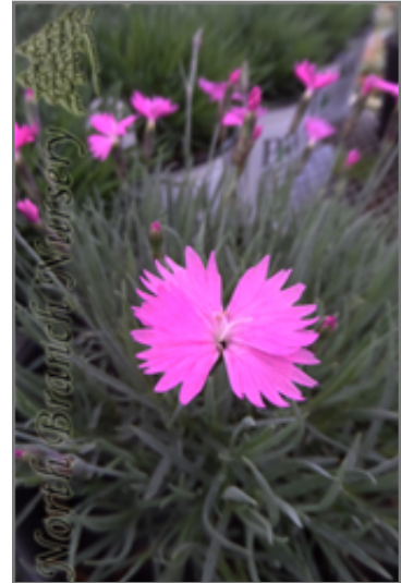
Firewitch Dianthus

Firewitch Pinks is a fine choice for the garden, but it is also a good selection for planting in outdoor pots and containers. It is often used as a 'filler' in the 'spiller-thriller-filler' container combination, providing a mass of flowers and foliage against which the thriller plants stand out. Note that when growing plants in outdoor containers and baskets, they may require more frequent waterings than they would in the yard or garden.