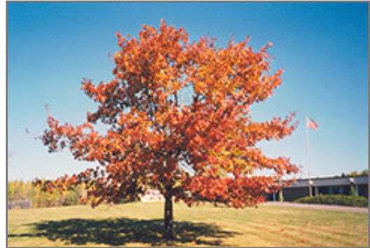
Red Oak in fall