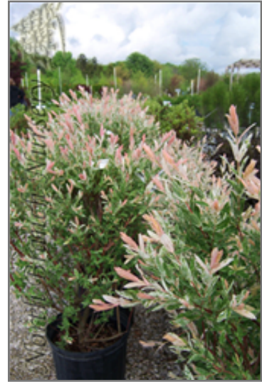
Dappled Willow