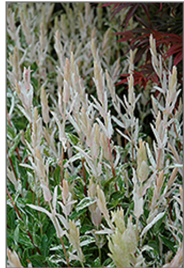
Dappled Willow foliage