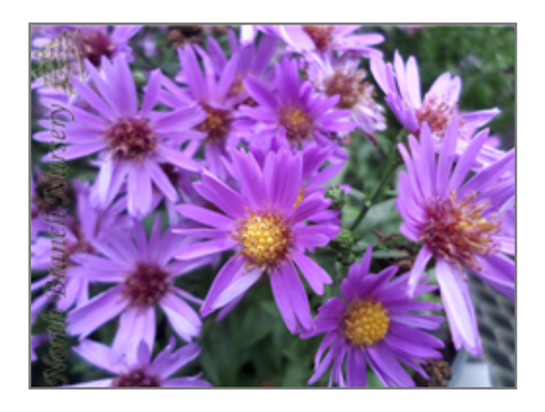
Woods Purple Aster