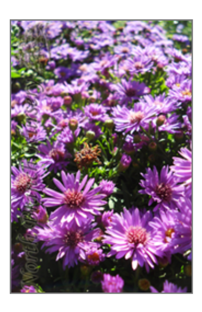
Woods Purple Aster