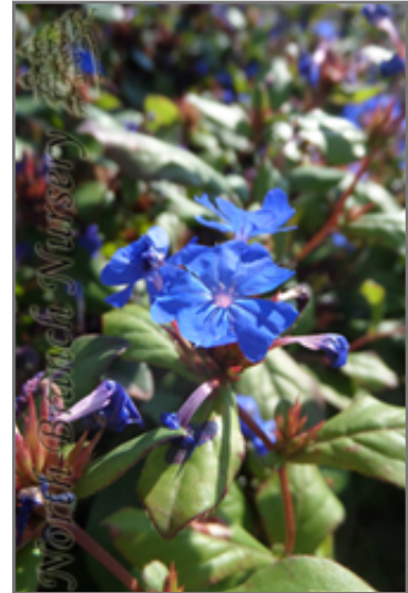
Plumbago Flower

This plant does best in full sun to partial shade. It does best in average to evenly moist conditions, but will not tolerate standing water. It is not particular as to soil type or pH. It is somewhat tolerant of urban pollution. Consider covering it with a thick layer of mulch in winter to protect it in exposed locations or colder microclimates. This species is not originally from North America. It can be propagated by division.