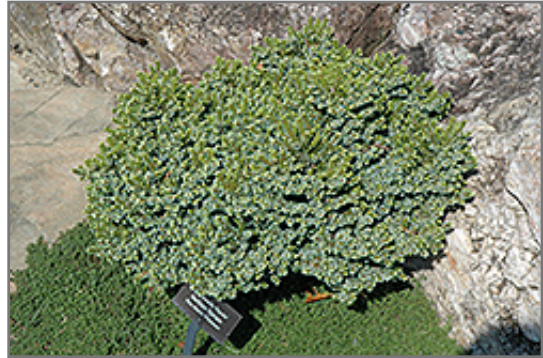
Pimoko Spruce