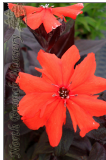
Orange Gnome Maltese Cross