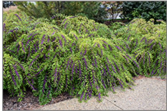
Issai Beautyberry fruit