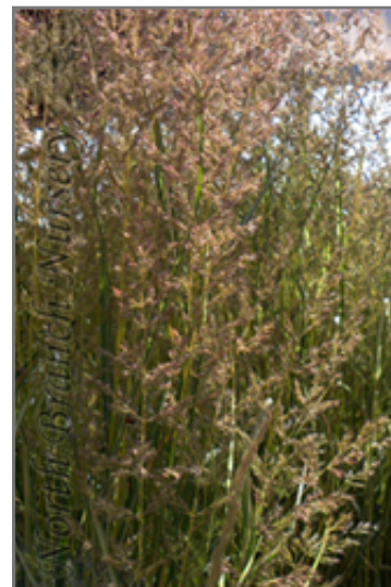
Eldorado Feather Reed Grass