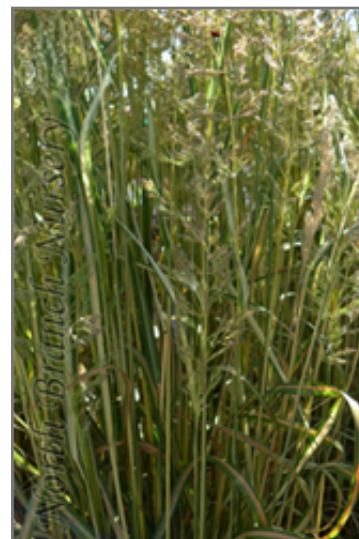
Eldorado Feather Reed Grass

Eldorado Feather Reed Grass is a fine choice for the garden, but it is also a good selection for planting in outdoor pots and containers. Because of its height, it is often used as a 'thriller' in the 'spiller-thriller-filler' container combination; plant it near the center of the pot, surrounded by smaller plants and those that spill over the edges. It is even sizeable enough that it can be grown alone in a suitable container. Note that when growing plants in outdoor containers and baskets, they may require more frequent waterings than they would in the yard or garden.