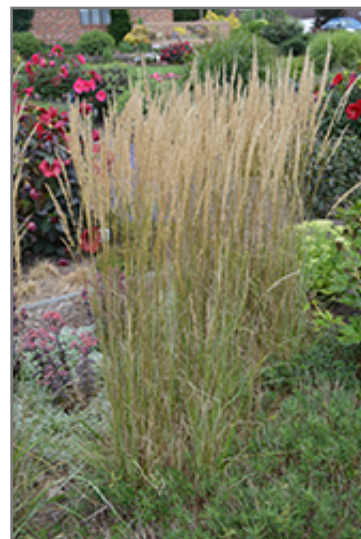
Eldorado Feather Reed Grass

Eldorado Feather Reed Grass is recommended for the following landscape applications;