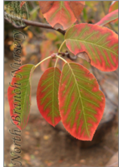
Princess Di Serviceberry