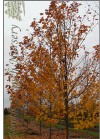
Celebration Maple Fall Color