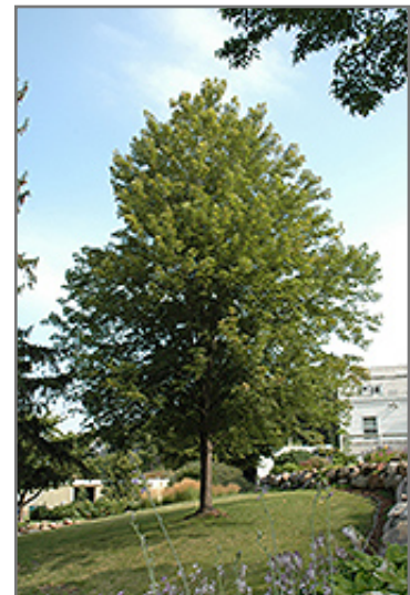
Celebration Maple