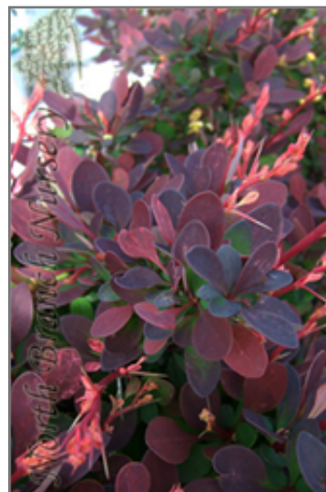
Rose Glow Barberry