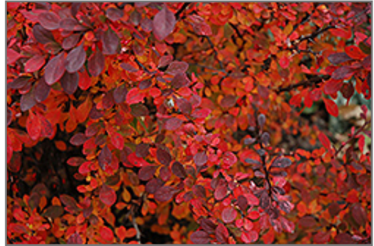
Rose Glow Japanese Barberry in fall

Rose Glow Japanese Barberry will grow to be about 3 feet tall at maturity, with a spread of 24 inches. It tends to fill out right to the ground and therefore doesn't necessarily require facer plants in front. It grows at a medium rate, and under ideal conditions can be expected to live for approximately 20 years.