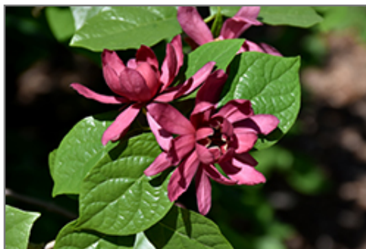
Common Sweetshrub flowers