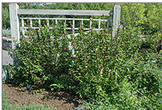
Common Sweetshrub in bloom