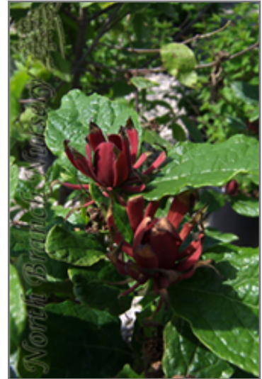
Bloom on Sweetshrub

This shrub does best in full sun to partial shade. It is very adaptable to both dry and moist locations, and should do just fine under average home landscape conditions. It is not particular as to soil type or pH. It is somewhat tolerant of urban pollution. This species is native to parts of North America.